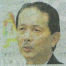
Dr Noor Hisham Abdullah

"Kluster Menara yang sudah menjangkiti 33 individu pula