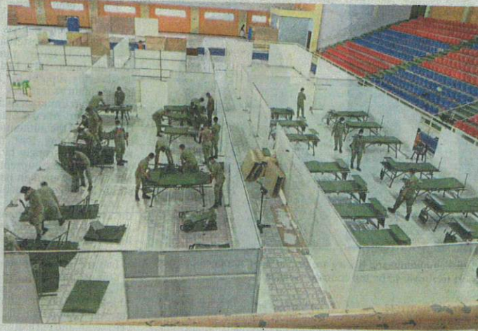
Military help: Military officers setting up a field hospital at the Tawau sports centre to help with unrelated Covid-19 cases including trauma surgery, maternity cases and other emergencies.

Emergency Physicians, who was also present, said the Covid-19 pandemic had shown them the best side of their staff members.